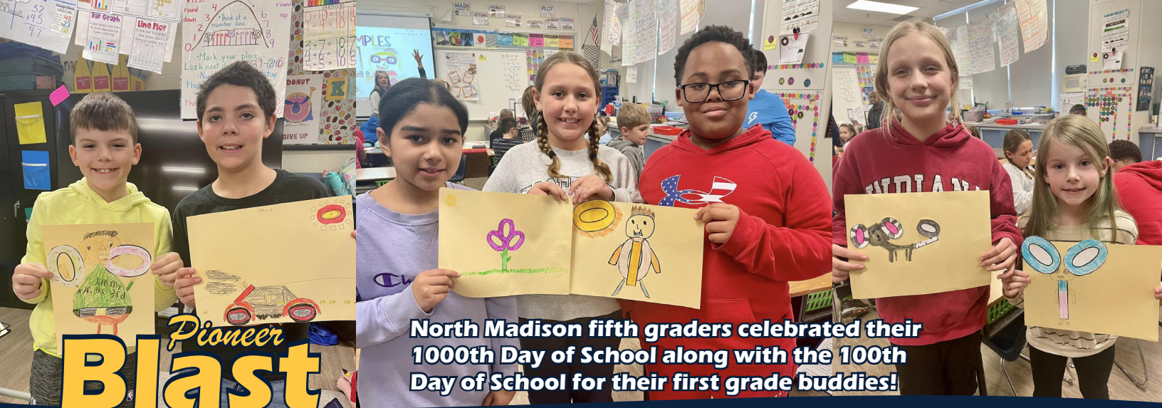
North Madison fifth graders celebrated their 1000th Day of School along with the 100th Day of School for their first grade buddies!