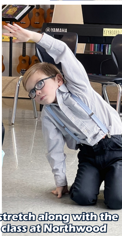
"100-year-olds" stretch along with the lessons in music class at Northwood