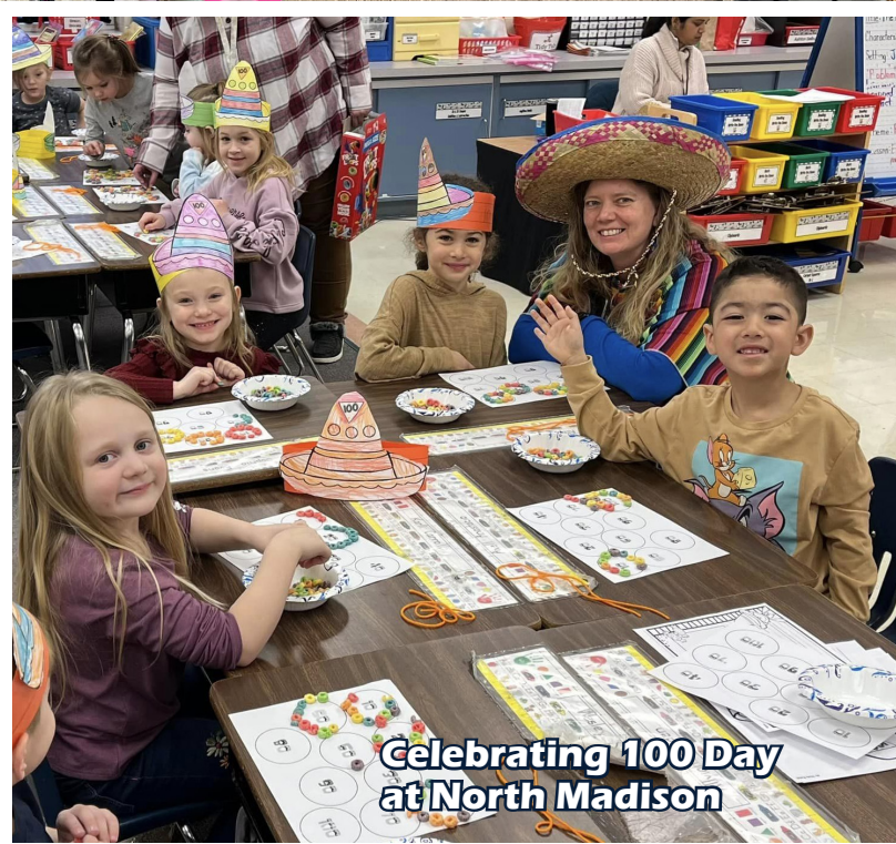
Celebrating 100 Day at North Madison